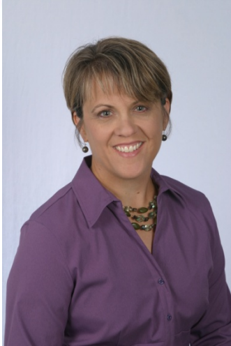
NEW !! SENIOR COORDINATOR